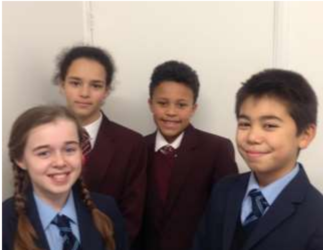
The Head Boys and Girls shared lots of ideas. Thank you Ingatestone Junior School for coming to visit.