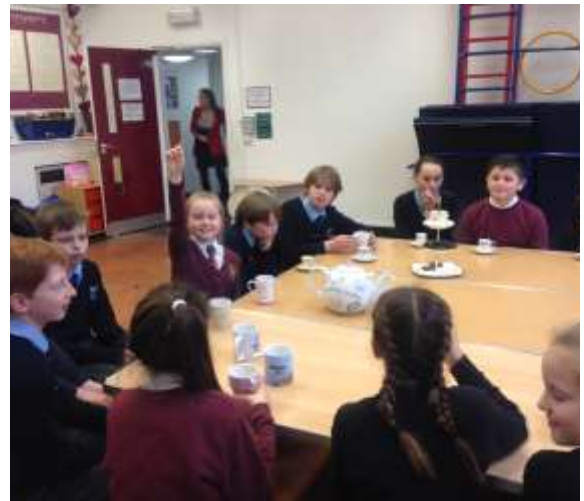
Lots of hot chocolate, tea and biscuits to help our House Captains share ideas.